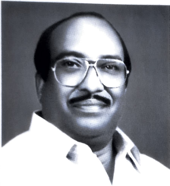
SRI. VELLAPPALLY NATESAN Manager Sree Narayana Colleges