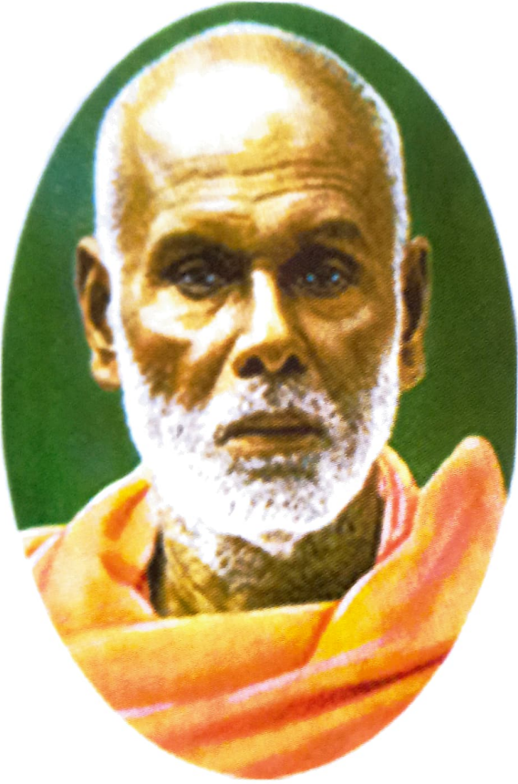
SREE NARAYANA GURU Our Guiding Light